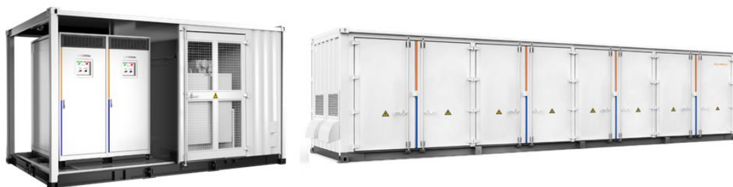
Plate 3-12 Typical battery storage unit (image reproduced courtesy of Sungrow).

3.4.323.5.32 Plate 3-12 below shows a typical battery storage unit, which shows the BESS racks and ancillary equipment.