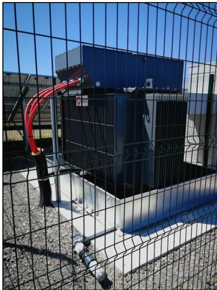
Plate 3-8. Typical outdoor transformer

3.4.18 3.5.18 Plate 3-8 shows an example of an outdoor transformer. The maximum footprint will be 5.5m by 6.5m in plan and up to 3.5m in height (see Figure 3-5).