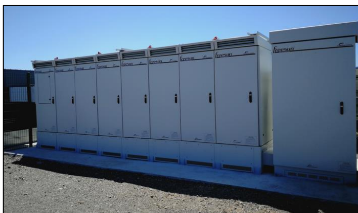
Plate 3-7. Typical outdoor centralised inverter

3.4.163.5.16 Centralised (meaning grouped together) inverters will be used, and these will be sited at regular intervals amongst the PV modules. The inverters will be units up to 9m by 6.5m in plan and a maximum 3.5m in height. This is the most common solution used on existing UK solar PV farms. Plate 3-7 shows an outdoor inverter. Figure 3-4 shows the illustrative layout of the centralised inverter.