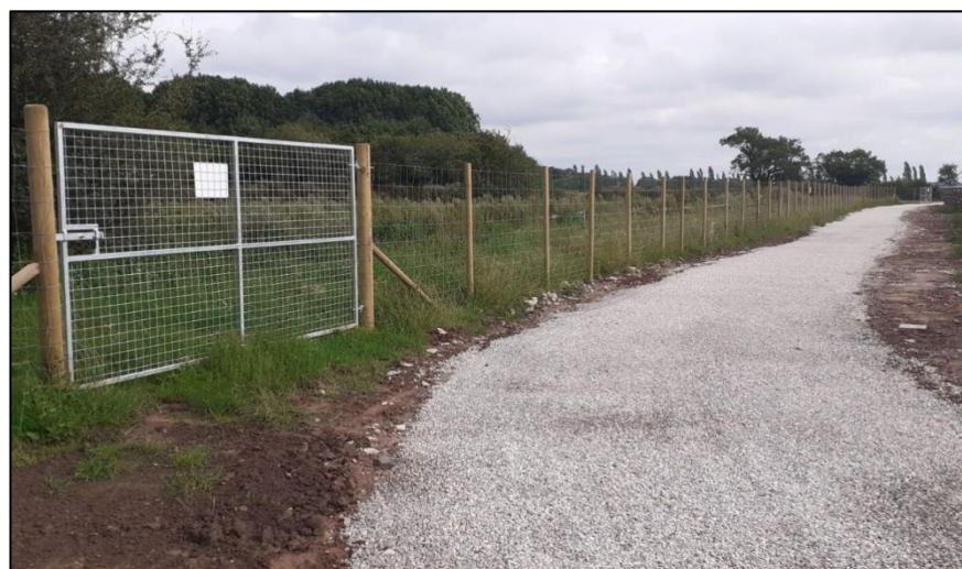
Plate 3-17. Example of an access path.