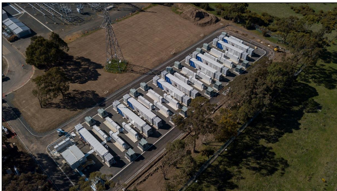
Plate 3-11. Typical battery storage compound configuration (image reproduced courtesy of Fluence Energy).

3.4.323.5.32 Plate 3-12 below shows a typical battery storage unit, which shows the BESS racks and ancillary equipment.