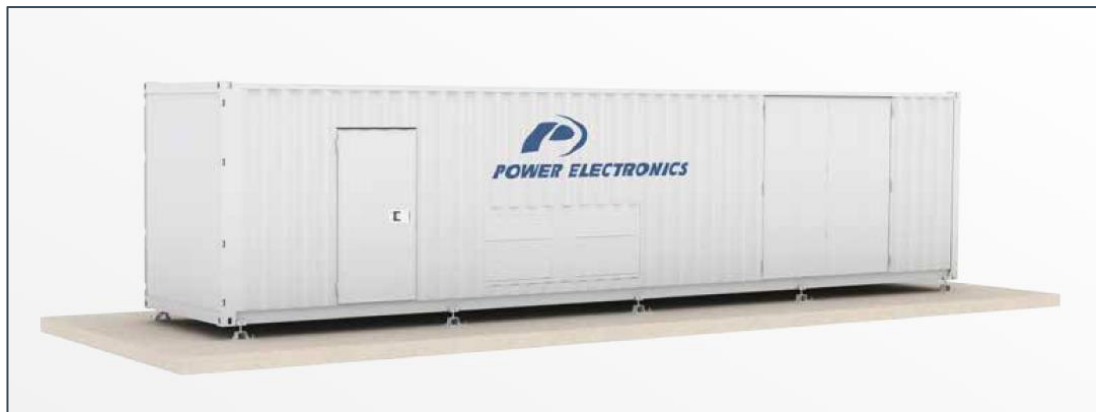
Plate 3-5. Example of white indoor solar station exterior

3.4.133.5.13 As shown in Plate 3-5 and Plate 3-6 and Figure 3-26, all equipment (inverter, transformer and switchgear) are included within a 15m ISO High-Cube Container with a footprint of 15m by 5m and a maximum height of up to 3.5m. The container will be externally finished to be in keeping with the prevailing surrounding environment.