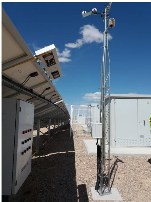
Plate 3-10. Weather Station