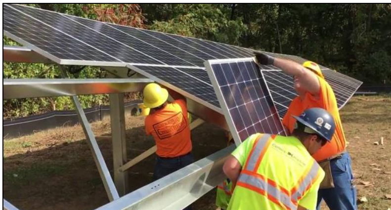
Plate 3-19. Construction staff mounting solar PV modules by hand.