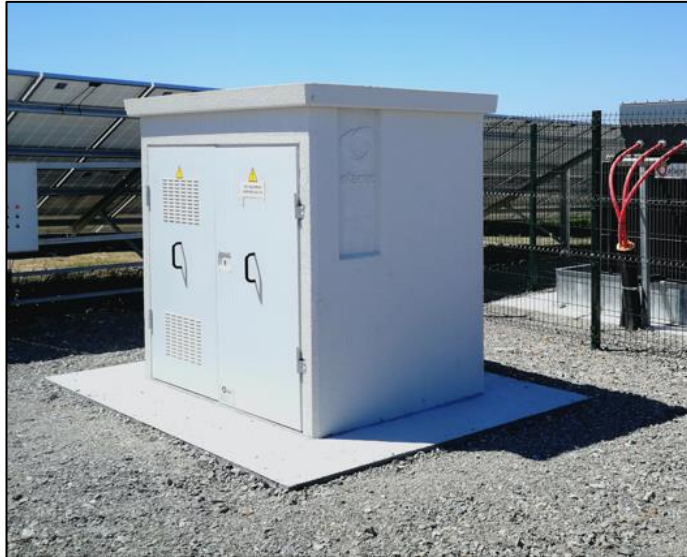
Plate 3-9. Outdoor cabin switchgear