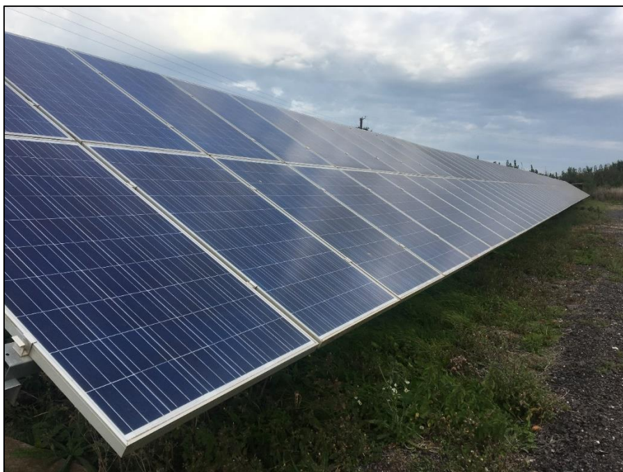
Plate 3-3. Solar panels (solar string) with south facing configuration