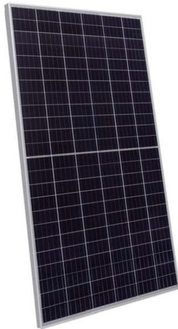
Plate 3-1. Illustration of a typical 144 cell solar panel

accommodate future technology developments. Therefore, the assessment will be based on the parameters outlined in Table 3-2 .