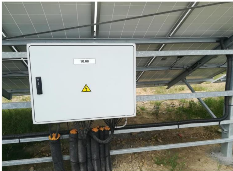
Plate 3-2. DC Electrical Box

3.4.83.5.8 The solar PV panels will be oriented to the south at a slope of 15 to 35 degrees from horizontal (see Plate 3-3 and Figure 3-3).