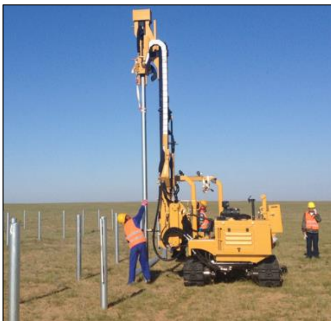
Plate 3-18. Ramming of module mounting structures.