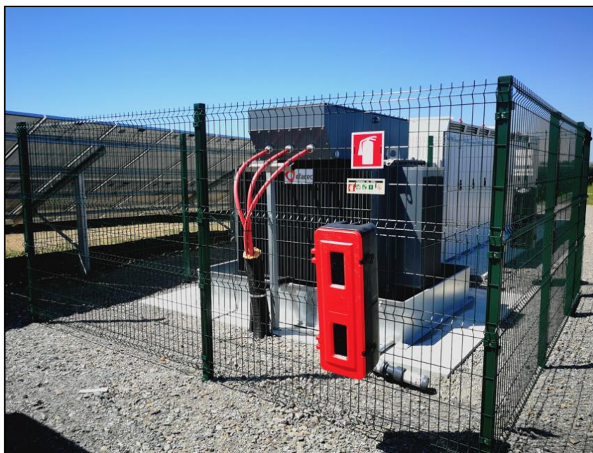
Plate 3-14. Typical transformer compound fencing

3.4.533 3.5.46 If outdoor transformers are used, they will be surrounded by a secure wire mesh fence, to comply with British Standard (BS) EN 62271-1:2017 (Ref 3-2), as shown in Plate 3-14 . This fence is will be a maximum of 2.5m in height.