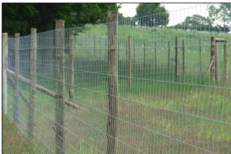
Plate 3-13. Typical deer security fence

3.4.513.5.44 A security fence will enclose the operational areas of the Sunnica East Site A, Sunnica East Site B, Sunnica West Site A, and Sunnica West Site B. The fence will be a 'deer fence', up to 2.5m in height (see Plate 3-13 ). Pole mounted internal facing closed circuit television (CCTV) systems will be deployed around the perimeter of the operational areas of each Site. It is anticipated that these will be 5m high. CCTV cameras will have fixed view sheds and will be aligned to face along the fence, utilising infra-red lighting to avoid the need for permanent lighting at the Scheme boundary.