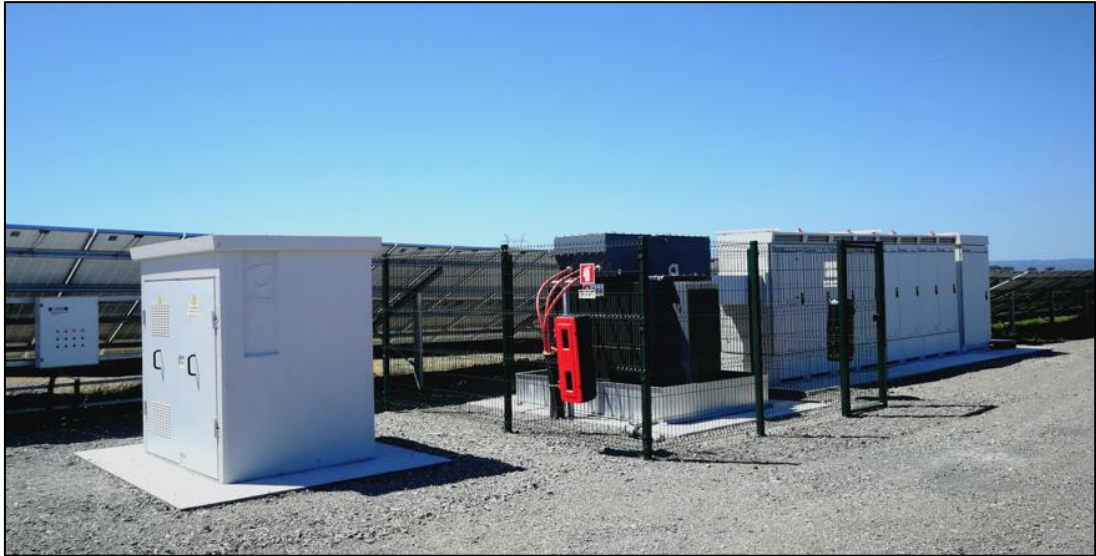
Plate 3-4. Outdoor solar station

3.4.123.5.12 As shown in Plate 3-4 , the inverter, transformer, and switchgear are placed outdoors and independent of each other. The maximum footprint for this will be 17m by 6.5m and up to 3.5m in height.