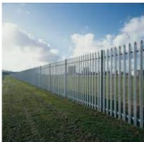
Plate 3-15. Standard palisade fencing

3.4.543 3.5.47 Fencing around the BESS, the onsite substations and Burwell National Grid Substation Extension- Option 2, if required will be standard palisade fencing up to 2.5m in height, see Plate 3-15 .